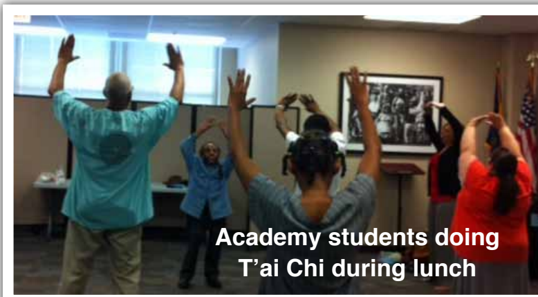
Academy students doing T'ai Chi during lunch