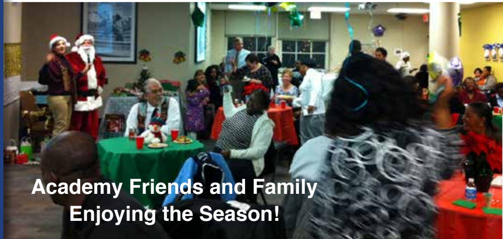
Academy Friends and Family Enjoying the Season!

In December the Academy students, their families and the entire staff of The Sierra Group came together to celebrate the season! More than 200 people enjoyed food, music, and gifts for the children from Santa.